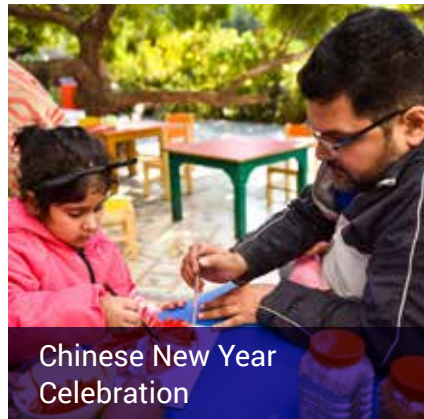
Chinese New Year Celebration