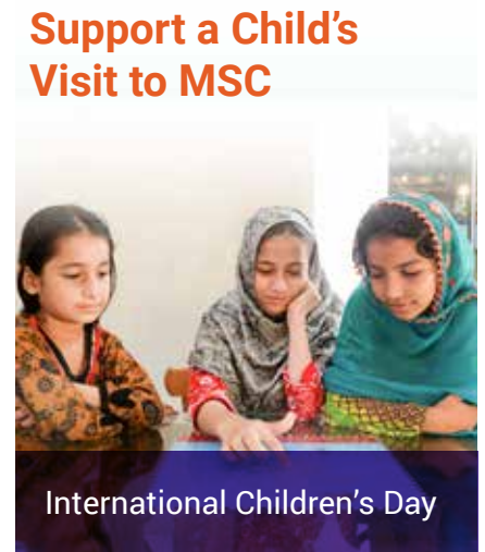
Support a Child's Visit to MSC