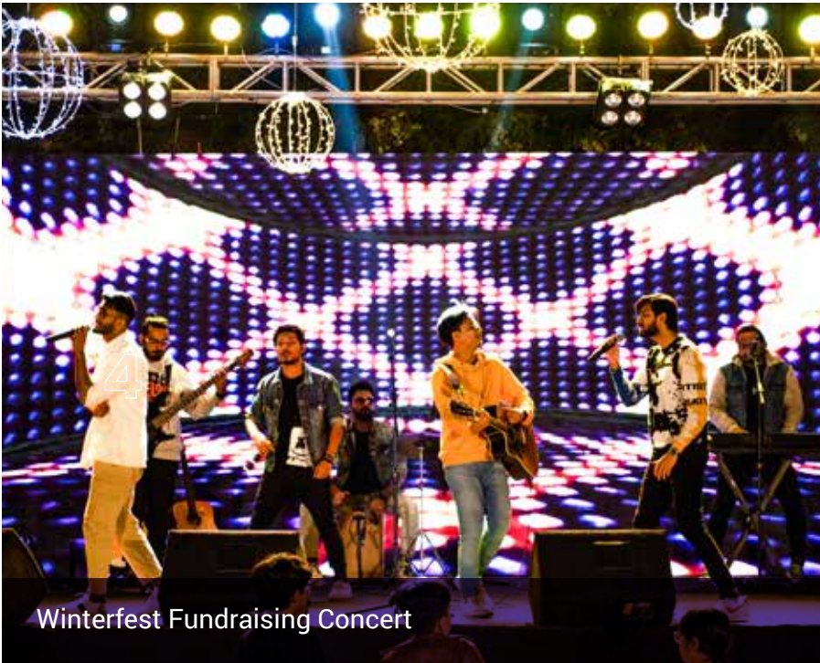
Winterfest Fundraising Concert