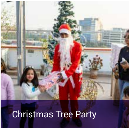
Christmas Tree Party