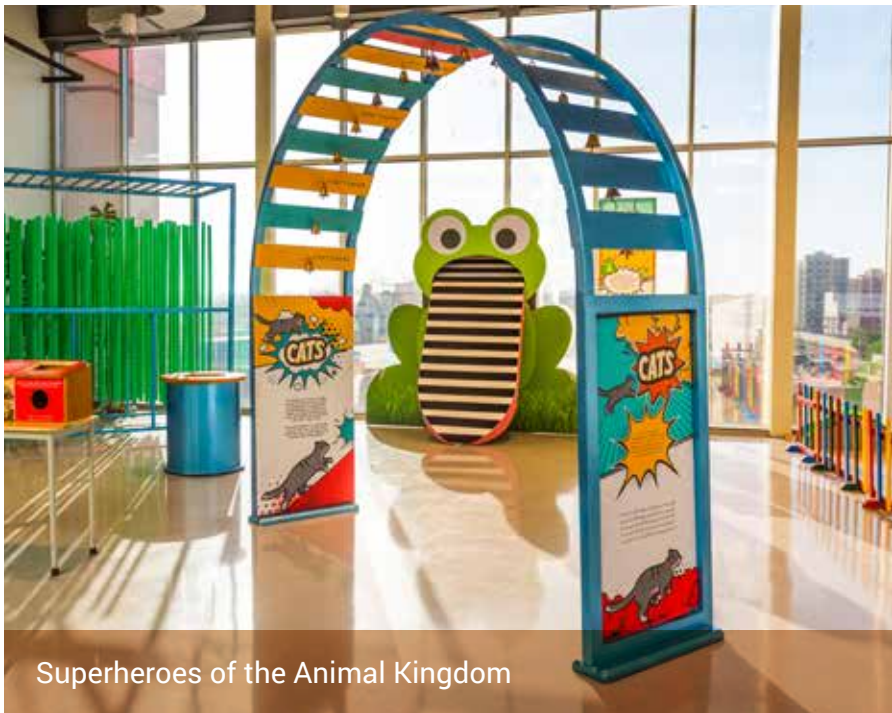
Superheroes of the Animal Kingdom

We at TDF MSC are committed to bring you exciting themes that spark curiosity and encourage learning. During the past six months, we have launched several sections throughout the Centre to keep the buzz alive.